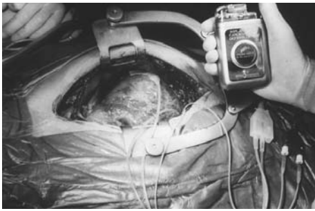
Figure 4. Implanting of the electrode patch leads after sternotomy during the first automatic defibrillator implantation in Hannover 1984.

Intraoperative defibrillation threshold testing was simple because the first devices were not programmable. Sensing of ventricular fibrillation used an interesting algorithm of "probability density function". Initially shocks with monophasic waveforms were asynchronously delivered, but two years later adding synchronous shock delivery allowed cardioversion for ventricular tachycardia. The only programmable feature at this time was the cut-off rate for ventricular tachycardia or fibrillation (VT/VF). Patient follow-up needed an external magnet over the implanted generator and a monitor unit that indicated the charge time and the number of delivered shocks (Figure 5).