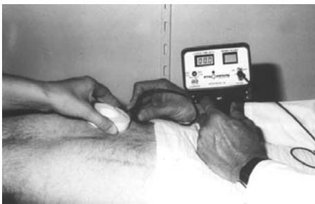
Figure 5. Follow-up of a patient with an abdominally implanted automatic defibrillator in 1984. A magnet is placed over the implanted generator. The monitor was connected to a sensing device, also held over the implanted generator. Retrievable were the number of delivered shocks and the charge time for the shock.

Five years (1985) after the first defibrillator implant the Food and Drug Administration approved the ICD after about 500 implanted devices. In 1988 the combined endocardial-subcutaneous patch lead system was introduced which made thoracotomy unnecessary. Sensing was now done from the right ventricular lead and defibrillation was performed between the right ventricular coil and the left lateral subcutaneous patch electrode. In 1991 the biphasic shock waveform was introduced, and devices became fully programmable. At this time about 10 000 devices had been implanted by five different ICD manufacturers. Around 1995 all devices had exclusively endocardial sensing and defibrillation leads and allowed subcutaneous pectoral implantation of the pulse generator. After 1996 all defibrillators could deliver antitachycardia pacing prior to shock delivery, and provided the full range of anti-bradycardia pacing. In 2000 all ICD devices contained sophisticated tachycardia detection algorithms, reliable discrimination be-